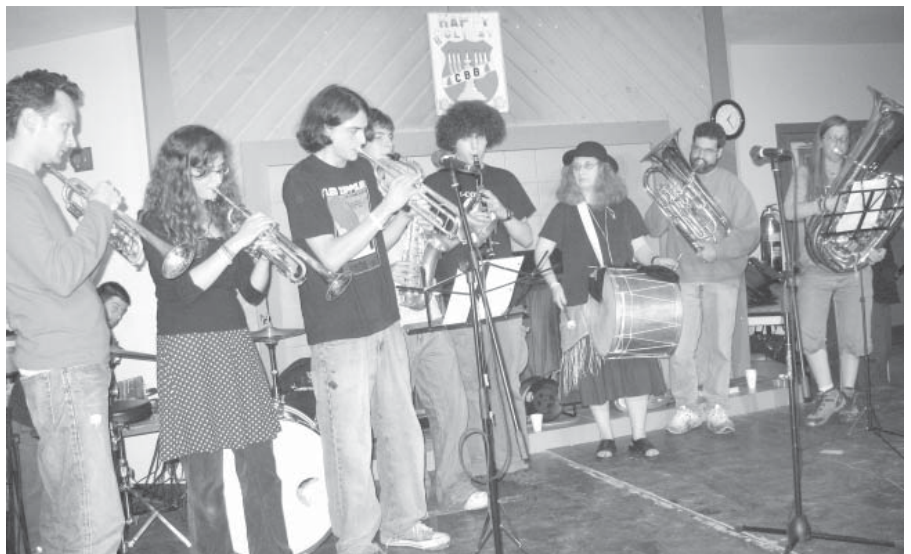
Balkan Brass Band, late night cabaret.