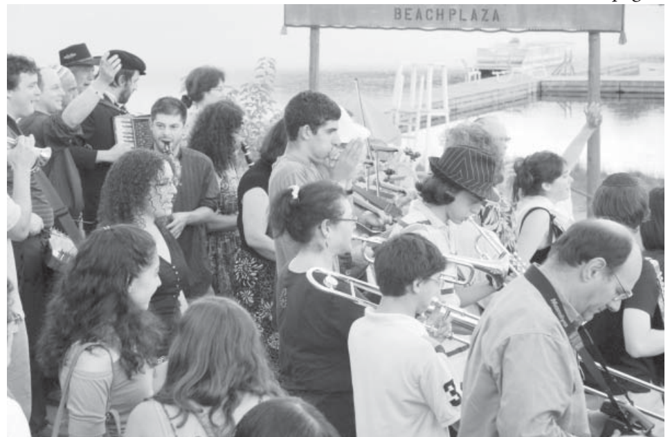
On Friday evening, as the sun sets and the Sabbath approaches, the KlezKanaders follow ancient (over a decade) custom and march backwards up the hill from the Retreat Center to the Dining Hall, thus symbolizing awe at the nearing of the Shekhinah , the Sabbath Bride. The traditional nign is sung, played, and danced over and over and over and over and over, with great joy, as we slowly approach the Sabbath.